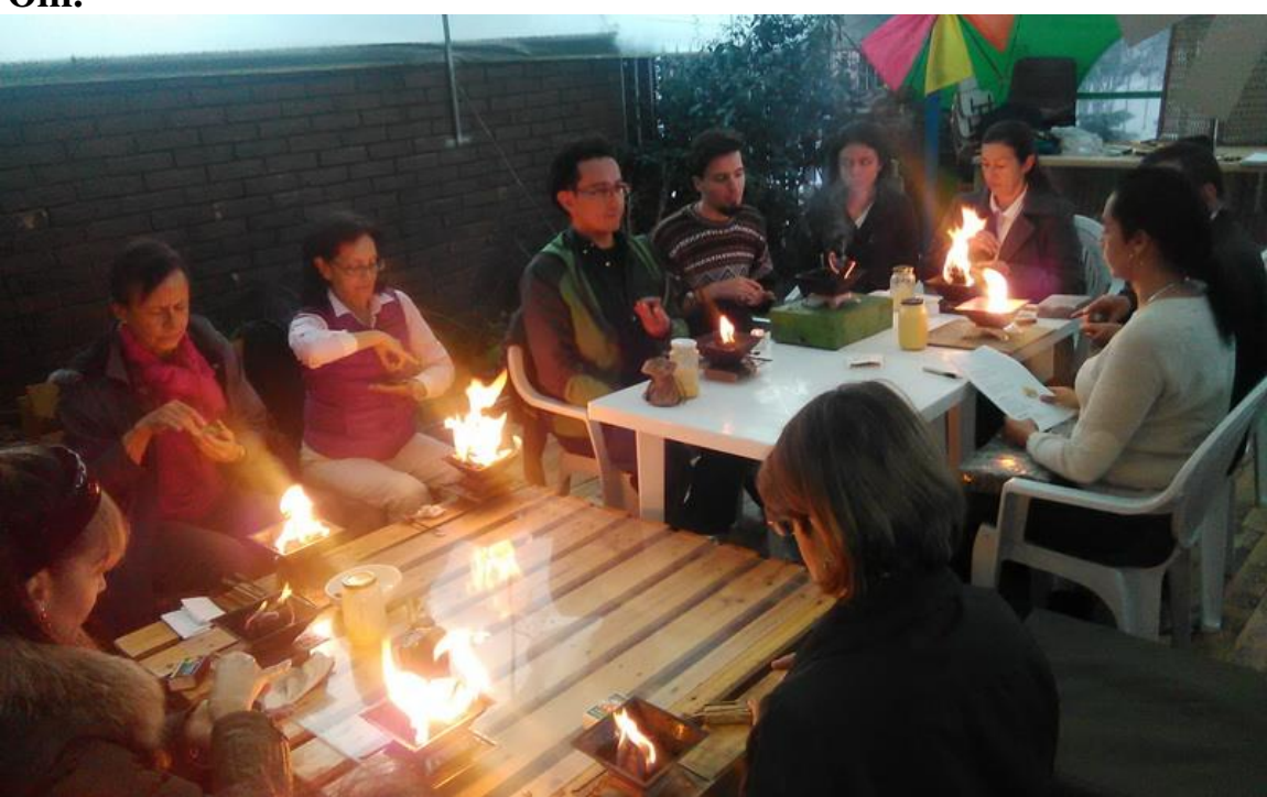
(Photos of this page meetings in the new Homa Center of Bogota, situated in the Esmeralda Barrio.)

And those who do not remember the technique well, please come to this Homa Center to remember, or join the centers in the different cities or look for constant practitioners and unite. Because AGNIHOTRA is the Light that Colombia now needs! Om Shree Om."