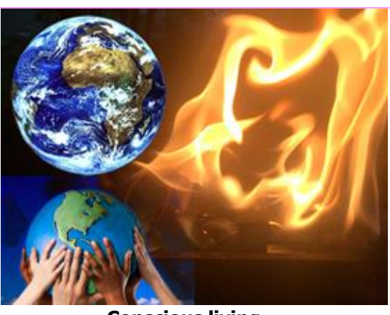
Conscious living = Practice of the Fivefold Path.

6) Reflection (As above, so below) 7) Everything is interconnected, etc. We will realize that we are "unconsciously attacking" the integrity of our planet (Mother Earth). 1) We do intensive mining that disfigures the surface and interior environment of mountains and lands. Something like a macro-surgery. 2) We heat the body of the earth with the exorbitant emissions of greenhouse gases (CO2, NO2, CH4, etc.) and other toxic gases. 3) We pollute and contaminate soils, subsoil, rivers, waters, seas, lagoons, and the atmosphere with chemical poisons. 4) We feed Mother Earth with: poisons, transgenic seeds, garbage, plastics, radioactive material, electromagnetic fields and dissonant vibrations 5) We cut and wildly remove organs from the planet (trees, mountains, rivers, etc.) by deforesting and construction (destruction). There are scientists who believe that the planet responds to this "attack" through self-adjustments generated by the movement of tectonic plates. These can generate: earthquakes, avalanches, tsunamis, landslides, floods, droughts, heat waves and cold, hurricanes, etc.