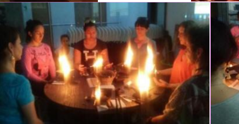
Photos of this page: celebrating Agnihotra daily in BoticaSol, located in the city Armenia, Colombia.