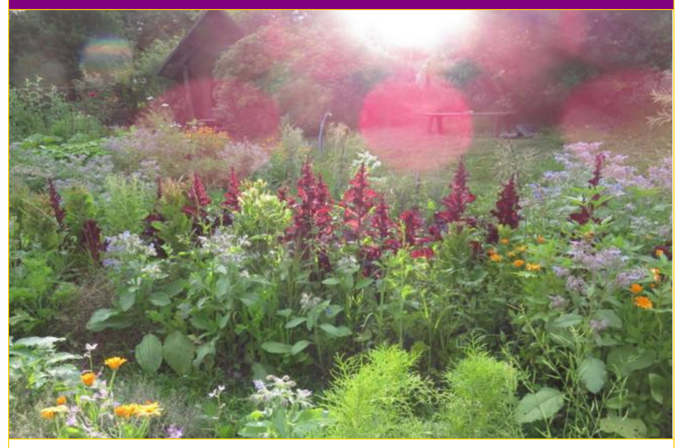
Ecovillage Bhrugu Aranya - Future home of Centre of Light

"This place is magical. The energies here are quite powerful and the place heals you. Bhrugu Aranya is an ancient place of fire which has been rediscovered in this time. We feel we are guardians of this sacred site. Often Devas and Angels have appeared here".