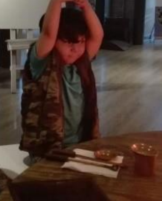
"The child is not a bottle to be filled, but a Fire that must be ignited."

Showers of Healing Energy during Agnihotra which bring us many positive physical and spiritual changes.