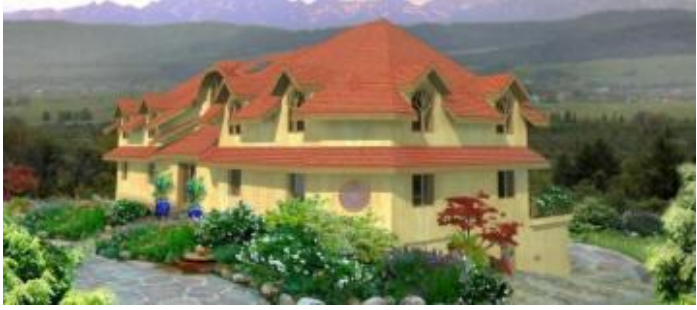
Computer generated Architect's drawing of completed Centre of Light.

Part of His plan is to create the Centre of Light, not only as a venue for teaching Homa Therapy, but also as a safe haven for the coming times. It was Shree Vasant who instructed us to build the Centre of Light, and He continues to bless and guide this project.