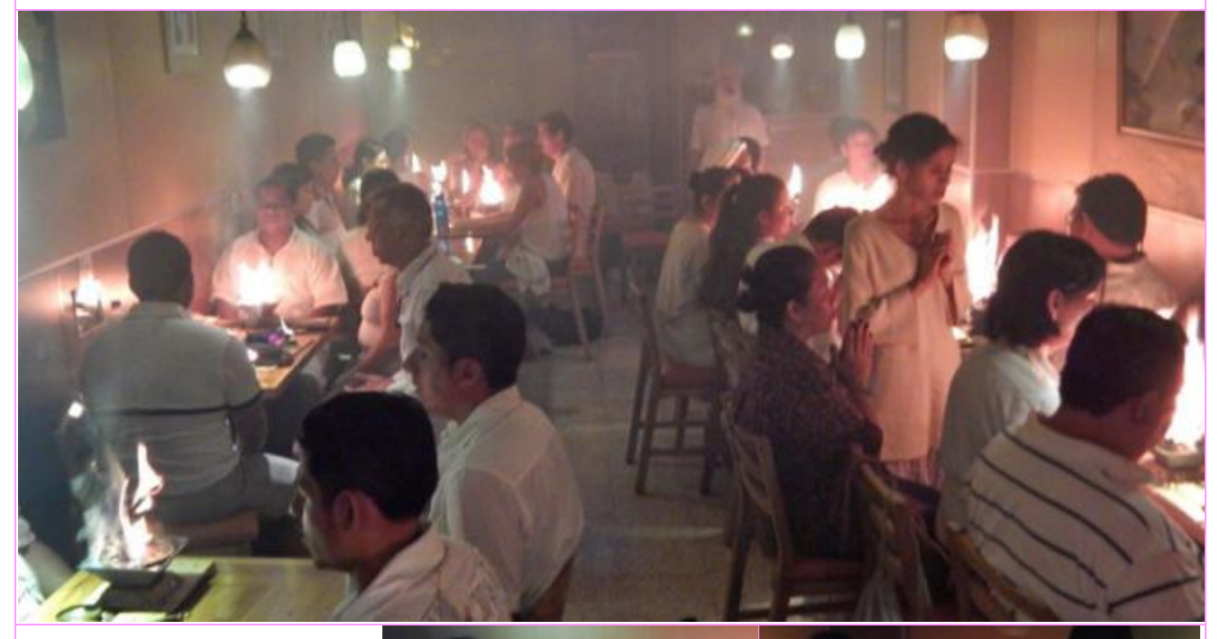
Photos of this page: After the massive practice of Agnihotra and the Vedic Fire Baptism, all the participants left Amaranto with a heart full of LOVE and GRATITUDE for so much GRACE received.