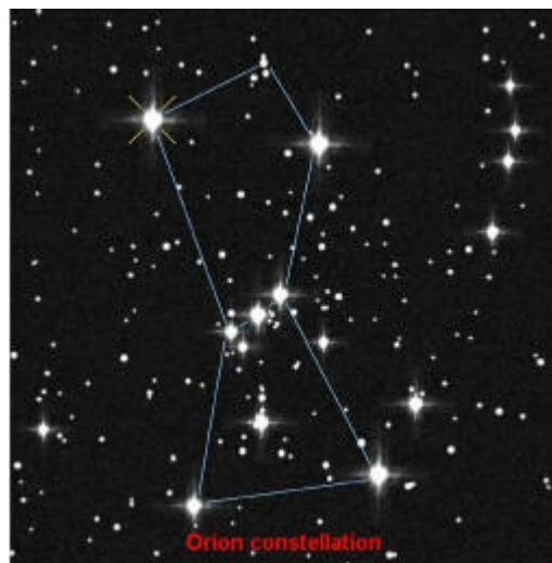
To read the complete Orion Transmission please enter: www.oriontransmissions.com

On a lighter note, there is the discovery of a new planet. Interesting that it took Earth so long to recognize this planet's existence. Scientists have known for a longer time actually. And yes, there is life on that planet.