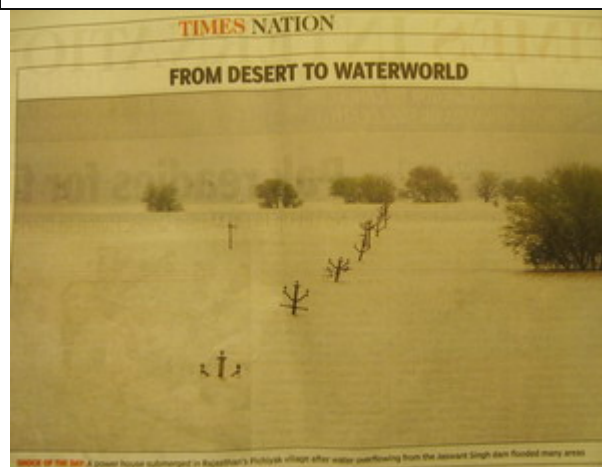
"The Times of India" Tuesday 10th of July 2007

Shock of the day: A power house submerged in Rajasthan's Pichiyak village after overflowing water from the Jaswant Singh dam flooded many areas.