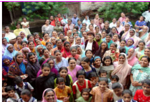
Many women are being helped through teaching them handicrafts in the area of cottage industry.