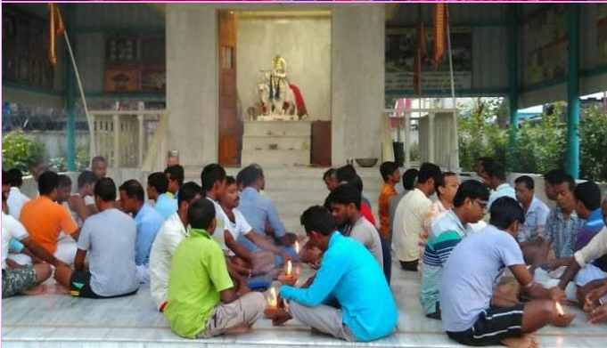
Photo below: Agnihotra training with farmers in Nadia district of West Bengal.

Photos on this page show the activities and teachings of Homa Therapy in the villages of West Bengal.