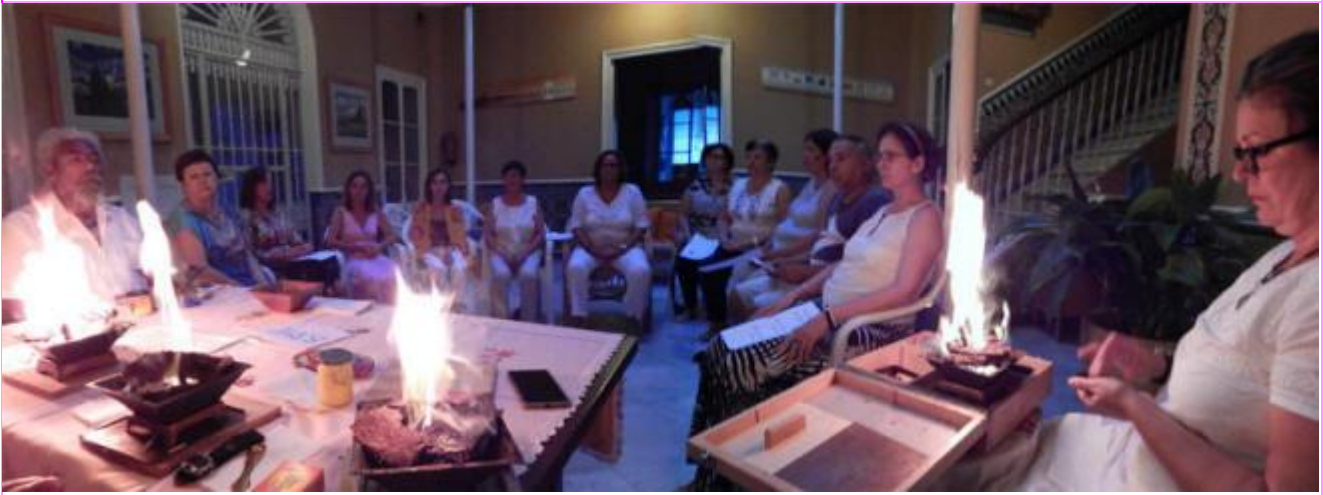
Photo: People participating at Agnihotra and commenting their experiences. Testimonies from the Shakti Centre, Puerto Real, Cadiz, Spain