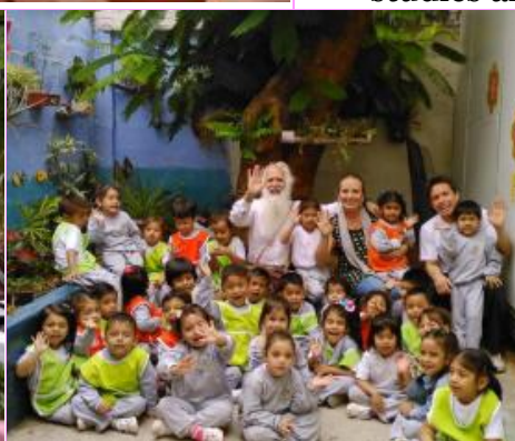
Photos of this school, where children have space and are animated to plant trees, flowers, herbs and other plants. It is an activity that connects them with the earth

and gives them joy, by seeing the results of their efforts and actions.