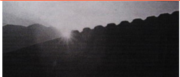
The Thirteen Towers constitute an ancient solar observatory.