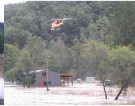
Our neighbours from across the road being rescued by a helicopter.