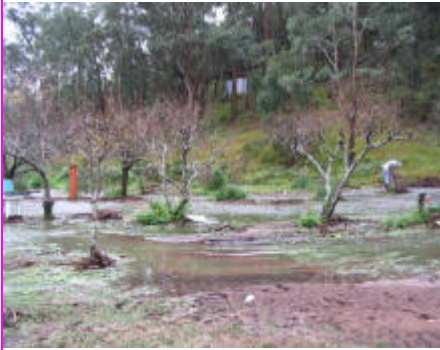
Om Shree Dham orchard during the heavy floods.