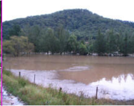
Our front paddock had joined the river that was once a tiny creek.