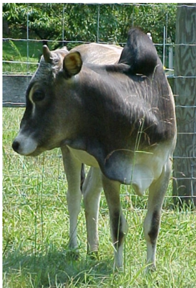
Homa Cows and their milk was not affected by the Chernobyl Radioactivity.