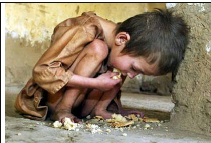
A starving child like it happens in too many places of our planet