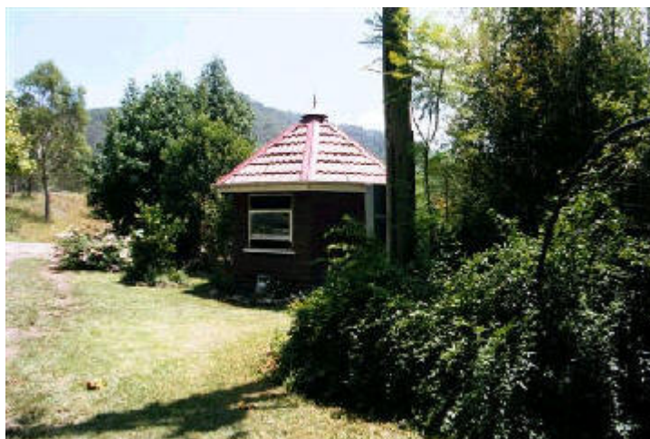
Fire hut of Om Shree Dham, where daily Agnihotra fire is practiced at sunrise and sunset.

Sub-Artesian water was found at thirty-three meters (100 Feet). It was laboratory tested and found to be HIGHLY SALINE AND ALKALINE. So, here was an opportunity to see what HOMA Therapy could do. We did AGNIHOTRA by the bore and regularly placed AGNIHOTRA ASH down the bore well. The State Department of Water Resources was conducting regular tests on the bore wells in our neighbourhood and we were all amazed to see the salinity and alkalinity drop with each lab report until we had POTABLE DRINKING WATER.