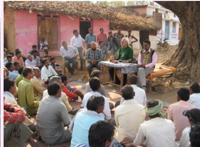
Kabirdham Village, Kuthu