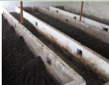
Earthworms in Homa atmosphere reproduce fast and produce high quality 'black gold'.