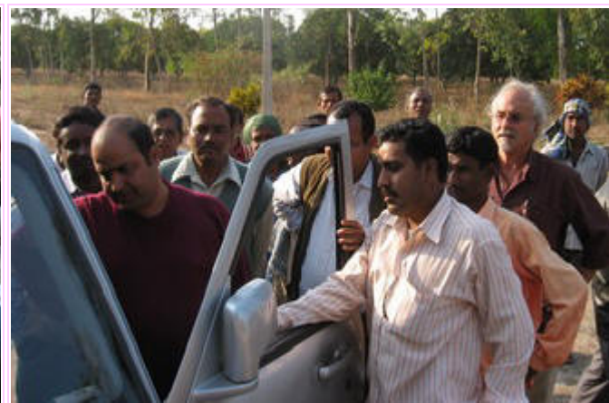
In Mohan Bhata, Bilaspur the speakers of the car were used to hook up the computer to present H.T.