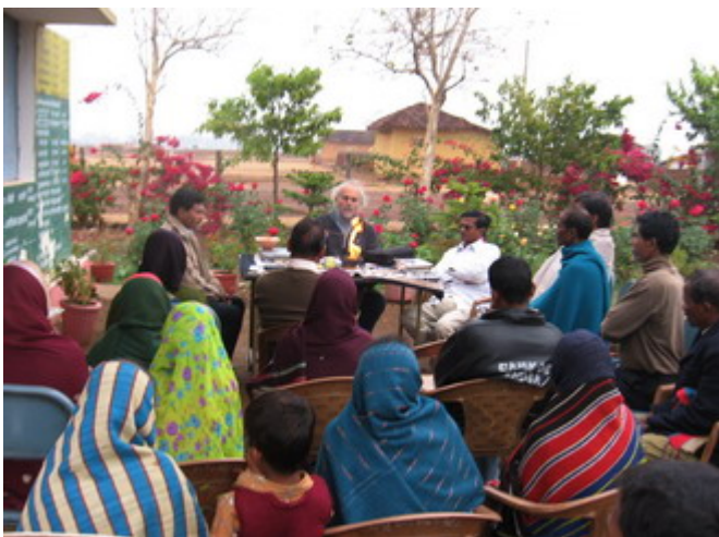
Aheri Village, Dist. Durg District