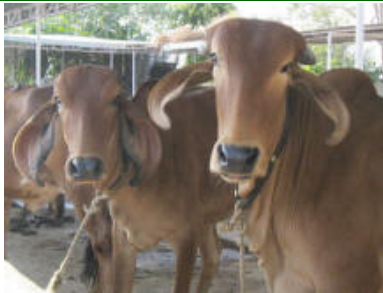
Native healthy cows with a hump, are an important factor in Homa Farming.

The farmers are experiencing many problems through plagues and diseases, weather conditions, seed and water quality, etc. which results in loss of crops and accumulated debts.