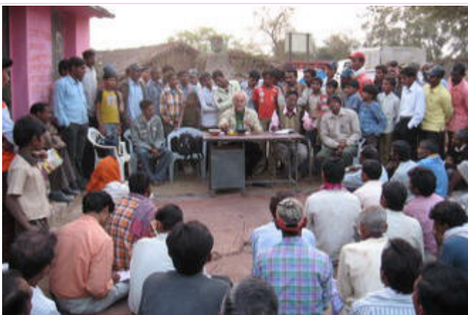
Village Kothar, Dist. Tahsil Kwardha