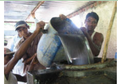
Preparation of Homa Biosol "Gloria". It is ready for use in less than one month.

Cow dung, cow's urine and vermi-compost (earth worm castings) and Agnihotra ash are essential for the preparation of Homa Biosol "Gloria", which is known for its quick and wonderful results in Homa Farming.