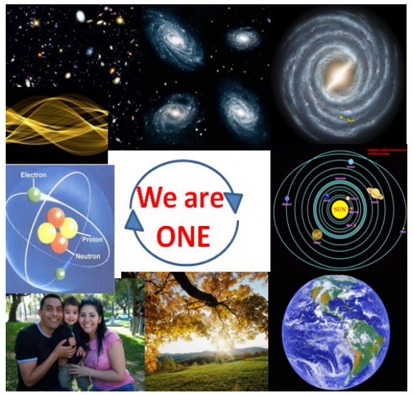
From the Macro to the Micro -Vibrations are everywhere.

Everything interrelated is through vibrations. And yes, certain vibrations can penetrate different layers of matter like an X-ray can go through the skin and picture the bones. We can also see that the natural waste of some organisms can be the food for others and vice versa in many ecosystems. It seems like everything has its purpose. And we also notice that a balance among the components must be kept so this dynamic circle of life goes on. In this play, you can see clearly that we (men) are part of everything and everything is or has part of us. However, men's actions (outpourings) can have strong impact in the а environment. His/her actions can be positive or negative.