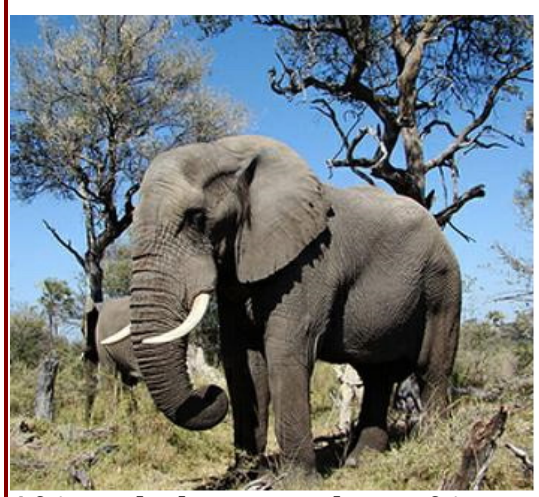
African elephant, Loxodonta africana, in Botswana