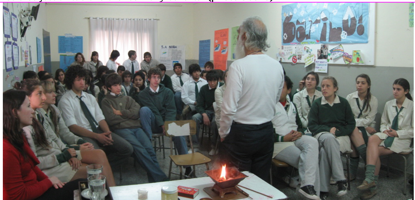
College "San Javier", San Miguel de Tucuman, Tucuman, Argentina