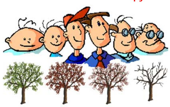
Is reality beyond the changing nature?

It is said, that when you meet a wise man, it is a great opportunity to focus on his virtues and see how you can develop them. It is also said, that when you meet an ignorant or a nasty person, it is also a good opportunity to look for the vices that you might be harboring, so you