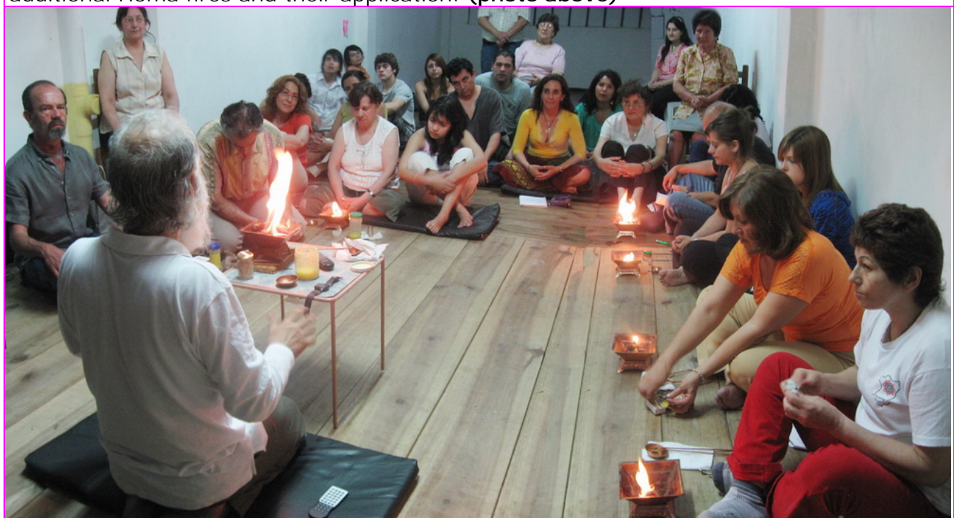
NaSer, San Miguel de Tucuman, Argentina

A Mantra workshop was given to Agnihotra practioners. They learned more about the additional Homa fires and their application. (photo above)