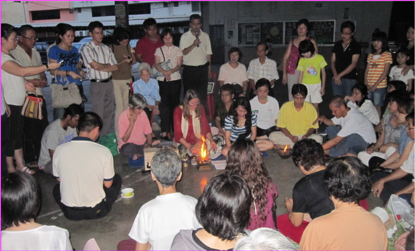
Photo shows Homa presentation and Agnihotra in the primary school in Muar on June 29th