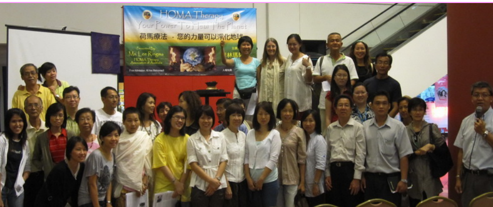
Photo left June 24th: Homa Therapy workshop in Kuala Lumpur at Pearl International Hotel, which was kindly sponsored by the owners for the use of the Homa venue. This healing event was very well visited.