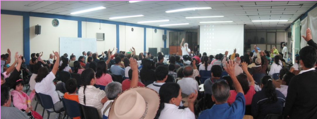
Photo to the left shows the Homa presentation in the Auditory of the SENA and photo below some of the Popayan Agnihotris at the healing Homa event.