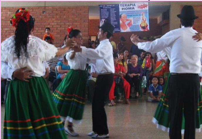
Grupo Instituto Gabriel Turbay. Thanks to all for sharing so much joy!