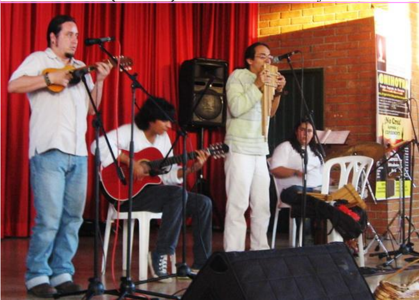
Musica Andina con el Grupo Karawaira