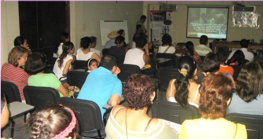
A couple of Homa presentations and Agnihotra sessions were held in the Red Cross of Santa Marta , where many came to know about this Ancient Vedic Healing Science. (photos left and below)