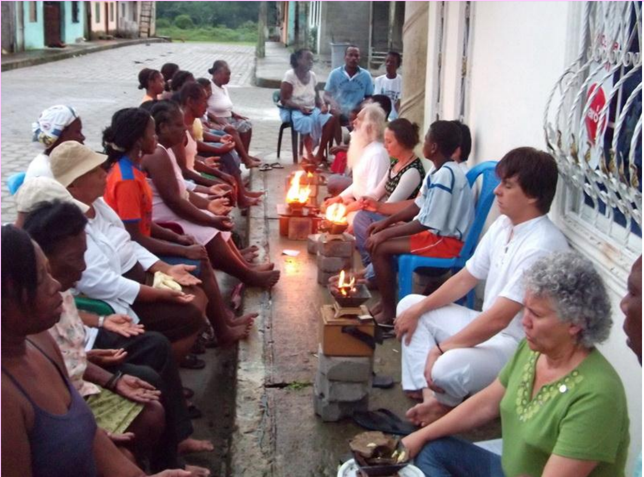
Morning Agnihotra on a sidewalk. The starting of the day with peace and serenity helps to have a wonderful day with a clear mind and positive energy.