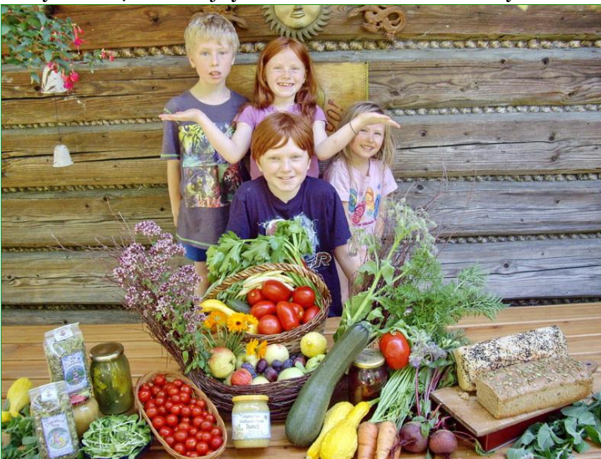
Photo above: Healthy Homa Harvest - Homa veggies, honey, herbs, fruit and healthy vegetarian children growing up in Homa environment, all grown with LOVE. Photo below: Bhrugu Aranya vegetable garden with spectacular view to the nearby mountain range.

And our climate is cold, sometimes-30°C in winter. Our growing season is short and still, our gardens are unstoppable!